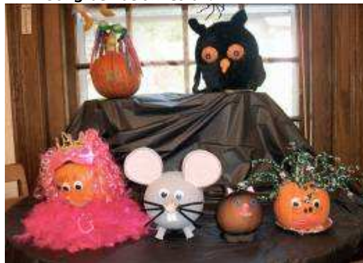
The winning pumpkins get together to celebrate their victory.

Another Fun Pumpkin Decorating Contest We had our annual Pumpkin Decorating Contest in October. People of all ages were invited to bring in decorated pumpkins. There were winners in 6 categories --