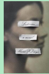
Ladivine , by Marie NDiaye