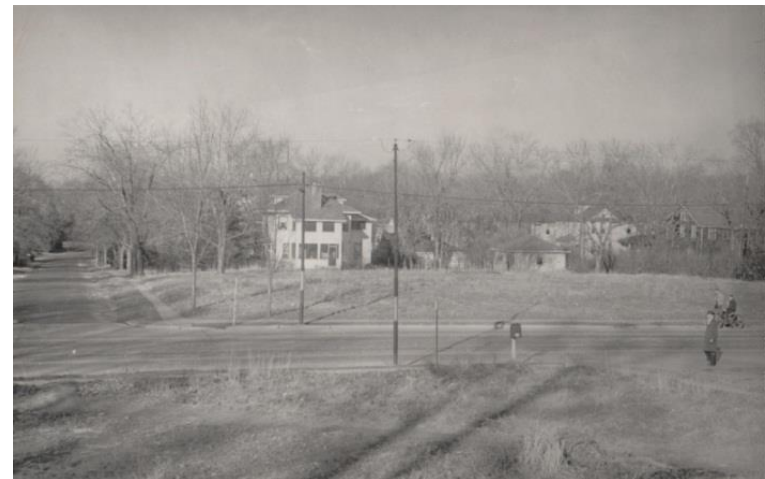
Looking north at Lockwood and Orchard Avenues, this is a 1948 view of the lot which would eventually become home to the new library.