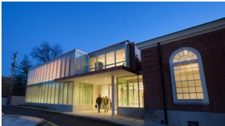
The completed addition