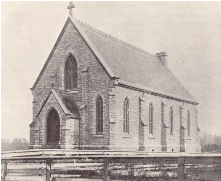
First Congregational Church

F ounded in 1866, First Congregational Church of Webster Groves occupied a significant place along Lockwood Avenue well before the City of Webster Groves incorporated. It was the first church founded in Webster Groves, though not by much—three other churches came into