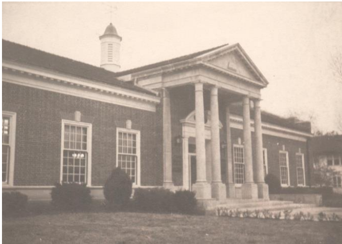
The new building at 301 E. Lockwood Avenue, 1951

In what may have seemed like a bit of postwar ebullience, the City of Webster Groves ran and easily passed a bond issue campaign in 1945 to fund eight separate municipal projects, ranging from street improvements to new public parks. The issue included $150,000 for a new library building.