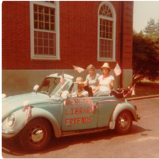
Friends of the Library ready for the Fourth of July Parade