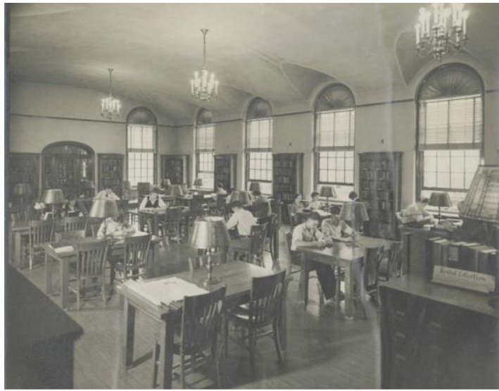
The Public Library Reading Room at Webster Groves High School