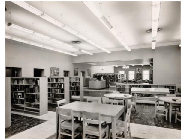
The Reading Room, showing a mix of modern and traditional elements

In a section called ‘Second Thoughts’ she details some of the things they could have done better, or at least differently. The Young Adult section was too close to the Children’s