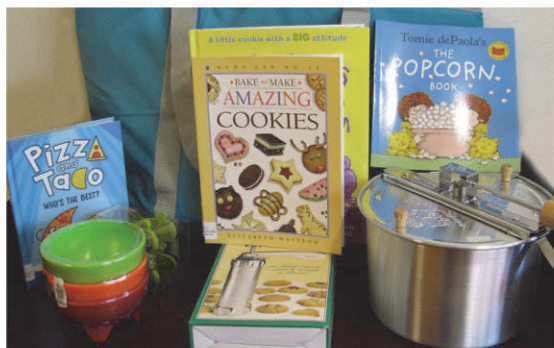
Kitchen Kits with tools for families to borrow