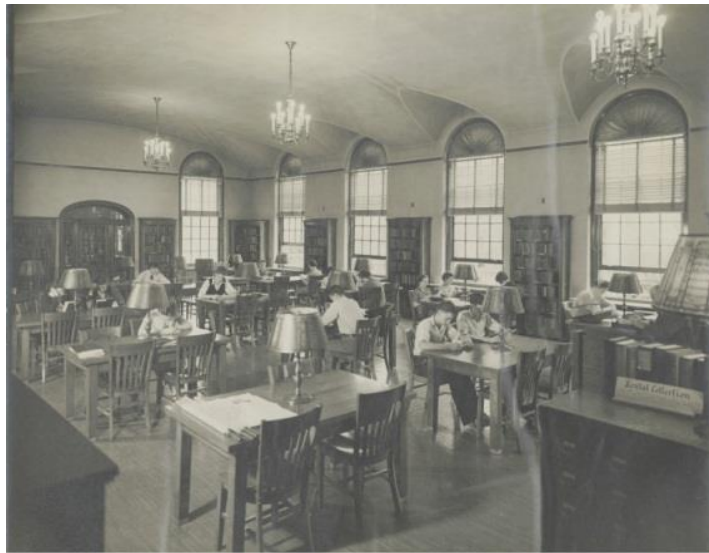
The Public Library Reading Room at Webster Groves High School