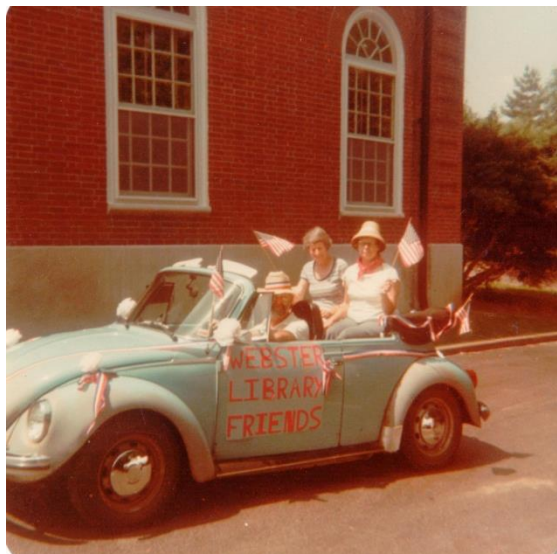
Friends of the Library ready for the Fourth of July Parade